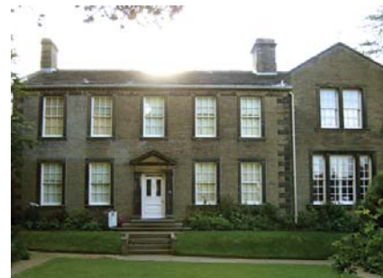
Bronte Parsonage, Haworth

Many public footpaths lead out of the village and there is much scope for rambling and walking. Haworth village makes an ideal base for exploring the principle attractions of the Bronte country, whilst being close to the major cities of Bradford and Leeds, with commuting distance to the M62 and Manchester and its surrounding towns.