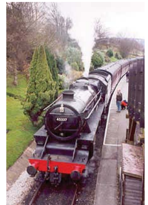
Worth Valley Railway Station