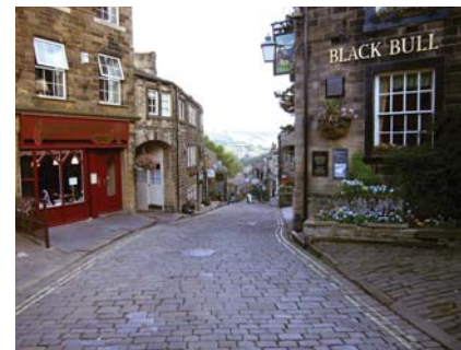
Main Street, Haworth